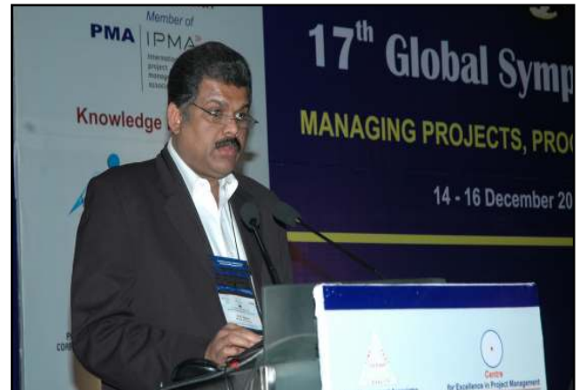
G K Vasan, Hon'ble Minister, Ministry of Shipping, giving the Valedictory Address on the 3rd day of the Symposium.

Since 1992, Centre for Excellence in Project Management (CEPM) and Project Management Associates (PMA), India have been organizing Global Symposiums on an annual basis. The GS in India is now considered to be one of the major events globally in the field of project management.