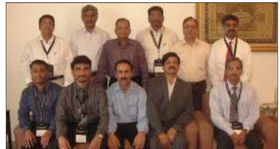
Fourth batch Level C/B Certification Assessors & Candidates from Ericsson Bangladesh, Ramky, NHPC, ITC, L&T, NTPC & Jindal Power, at Noida in March 2010.