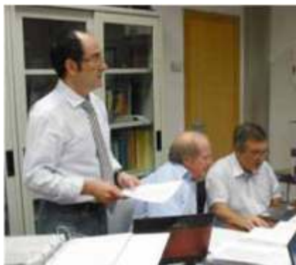
The Revalidation team at work