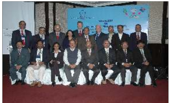
Participants for 2 Day workshop on Earned Value Management (December 15-16, 2009)

In the Indian context, EVM has a very large applicability and through red, yellow and green buttons depending upon the ratios of SPI and CPI can give a good idea of where we are and then we can focus as what strategies we should take to improve our project performance.