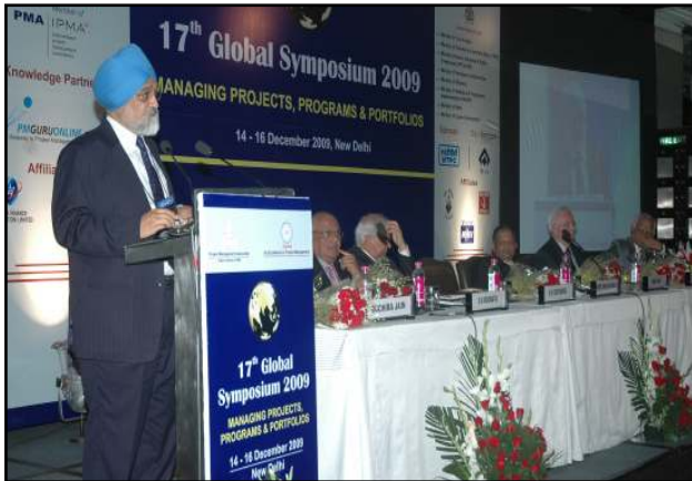
Montek Singh Ahluwalia, Hon'ble Dy. Chairman, Planning Commission, giving the Inaugural Address.