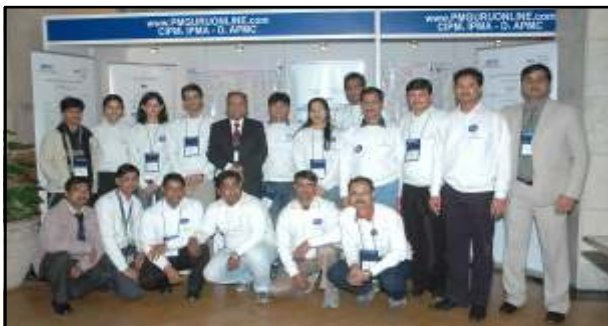
The team behind pmGURUonline.com the most sought after Internet Site for PM Certification preparation

There is a tremendous need of training professionals to use MS Project Software to monitor and control projects. CEPM has taken a lead in this area by launching Online Internet based MS Project training. The training is for 40 hours and is divided into 2 parts. Part 1 of 15 hours is to improve the fundamentals in understanding the intricacies of project management and Part 2 of 25 hours is to train professionals step by step through 7 Chapters in understanding the concepts behind MS Project. You can directly go to Part 2 if you hold CIPM or IPMA Level D or PGCPM from IGNOU credential.